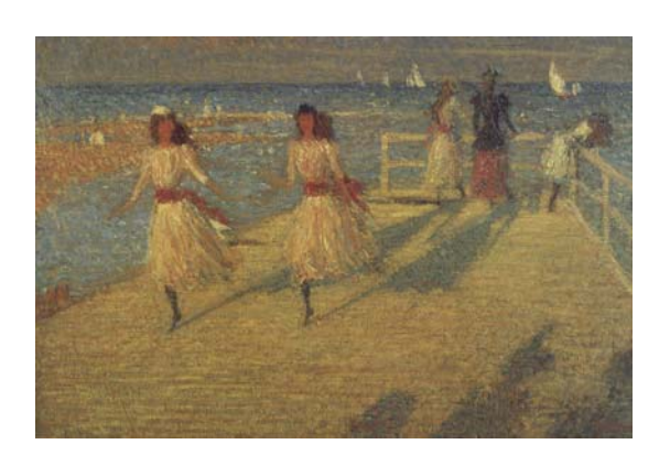
Philip Wilson Steer Girls Running, Walberswick Pier, 1888-94 Oil on canvas. 24 <sup>3</sup>/<sub>4</sub> x 36 <sup>1</sup>/<sub>2</sub> in.